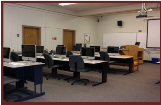
Pictured - Flagg 162

CTS provides support and leadership for SUNY Potsdam in all areas of information technology including desktop computing, networking, telephone services, administrative systems, and instructional technology. Important locations, some temporary to note due to Stillman Hall construction: