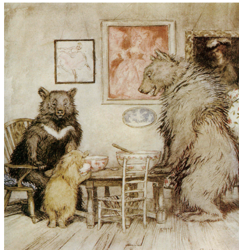
“Somebody has been at my porridge, and has eaten it all up!” From “The Story of the Three Bears”

The gadgets you buy as gifts this year could injure your children! Inside mini remote controls, small calculators, watches, key fobs, flameless candles, singing greeting cards and other electronics, may be a powerful coin-sized battery. If swallowed, a 20 mm lithium battery can get stuck in a child’s throat. Saliva triggers an electrical current creating a chemical reaction that can severely burn the esophagus leading to injuries and even death.