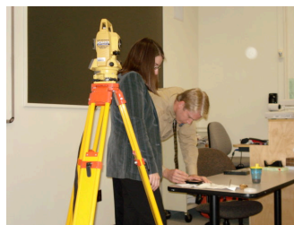
Faculty Fellow Presentation

Three other events were scheduled but were cancelled for a variety of reasons.