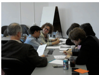
A New way to get students to Do the Reading AND Engage in Collaborative Learning