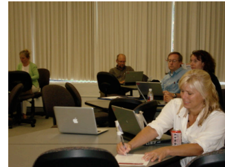
The new Blackboard Grade Center