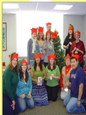
Our friendly and fun staff!