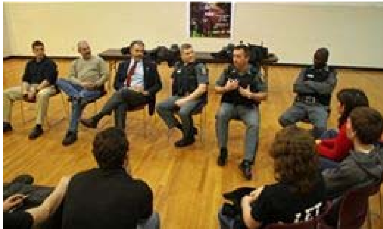
University Police panel discussion hosted by the Law Enforcement and Tactics (LET) club.