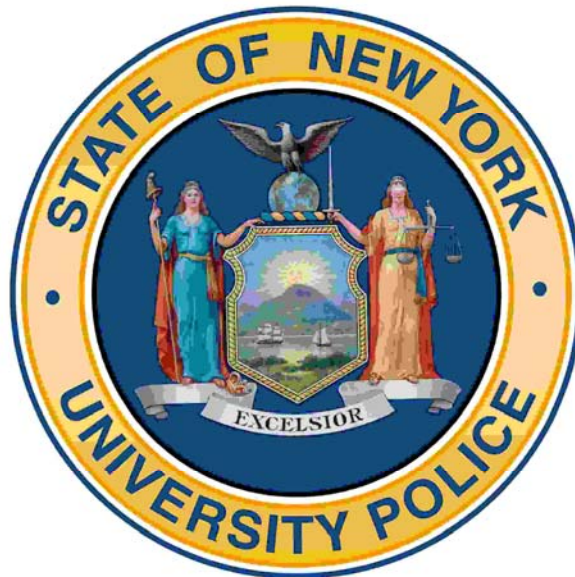
New State of New York University Police seal