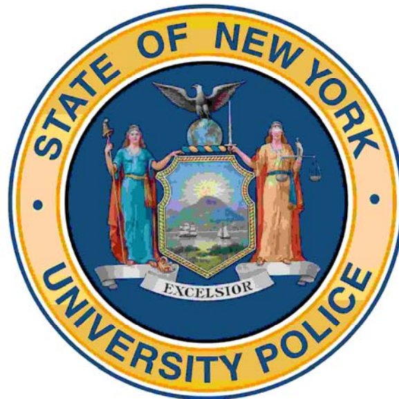
New State of New York University Police seal