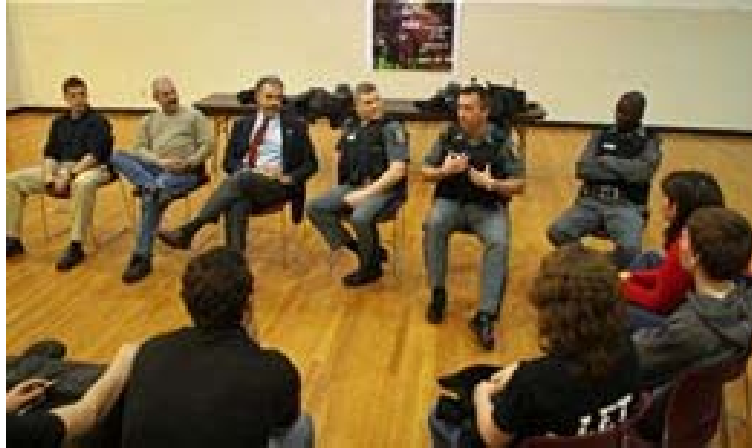
University Police panel discussion hosted by the Law Enforcement and Tactics (LET) club.