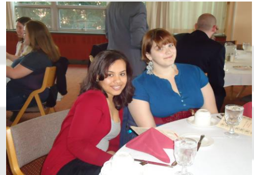
Annual Awards Ceremony