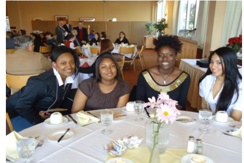
Annual Awards Ceremony