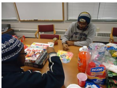
EOP Game Night

Stop by the main office and check out this semester's list of events.