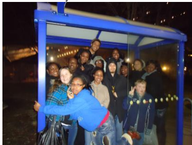
Buffalo Incentive Trip

Let's welcome the EOP Class of 2015 and start this year off right with a slew of events! Our academic workshops will be revamped for the best experience possible. Expect the Financial Literacy, Resume/Internship, and other workshops to be back with a vengeance, not to mention the fun game nights, movie nights, bowling night and trips that give you a chance to kick back and relax. Our EOP students' suggestions have been heard and implemented so this academic year will be full of new surprises! If you remember the excitement from last year, you know to expect even more this year!!