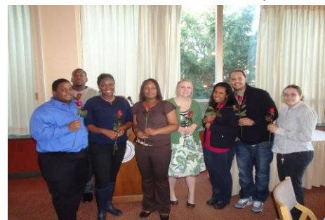
Annual Awards Ceremony