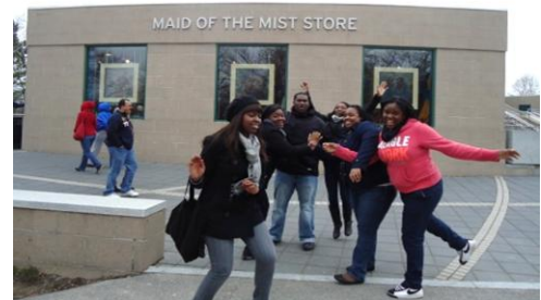
Buffalo Incentive Trip