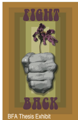
BFA Thesis Exhibit