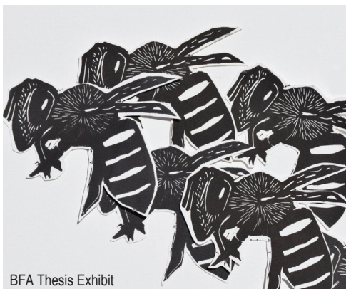
BFA Thesis Exhibit