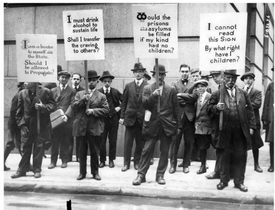
Eugenics demonstration on Wall Street, 1915.