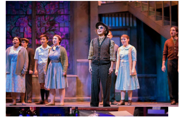
2018 production of the Pellicciotti Prize commissioned opera, Mayo