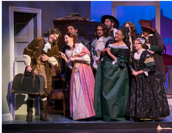
2017 production of Gianni Schicchi