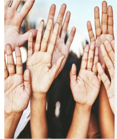
2022 Student Population