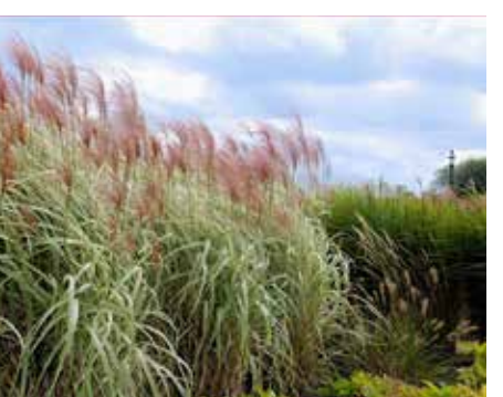
"Windy Day" by Sharon Cramer "Contrasting the upright light pole with the active grasses, I tried to convey motion. Seeking beautiful skies and interesting light is a photographer's eternal quest."

If you explore a link to any of the clubs listed, you will be in awe of the vitality and creativity amateurs invest in photography. In most cases, anyone can attend meetings