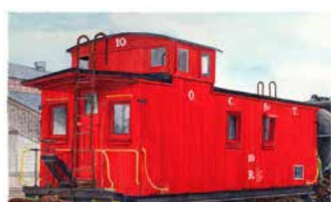
Oil Creek & Titusville Caboose #10

I have now painted 265 watercolor images of cabooses, which I exhibit at various train shows. I even have a website (<a href="www.cabooseart.com">www.cabooseart.com</a>) where people can view and, if they so desire, purchase my caboose paintings.