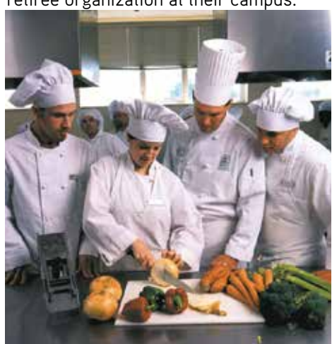
SCCC Culinary Arts Students at work

retirees of SUNY's 64 campuses, System Administration, the Research Foundation, the Construction Fund, and individuals who oversee existing campus retirement programs, and those interested in starting or expanding a retiree organization at their campus.