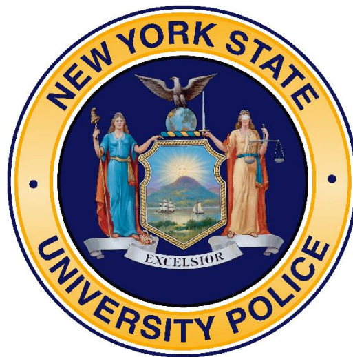
New State of New York University Police Seal

The University Police held a Ticket Amnesty Day on November 12, 2021, where donations to the food pantry were accepted and 36 tickets were dismissed.