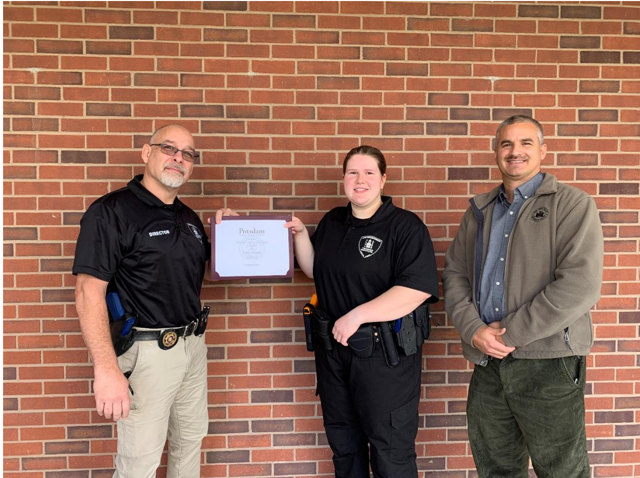
University Police/Criminal Justice Scholarship Awarded Fall 2021 $600