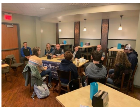
Coffee with a Cop 2019

Total Service Calls and Criminal Complaints: 1808