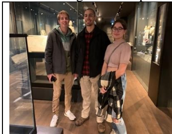
WAYS 103 students next to the mummy exhibit